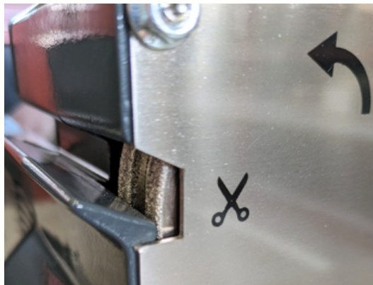
SCISSORS SHARPENING AREA